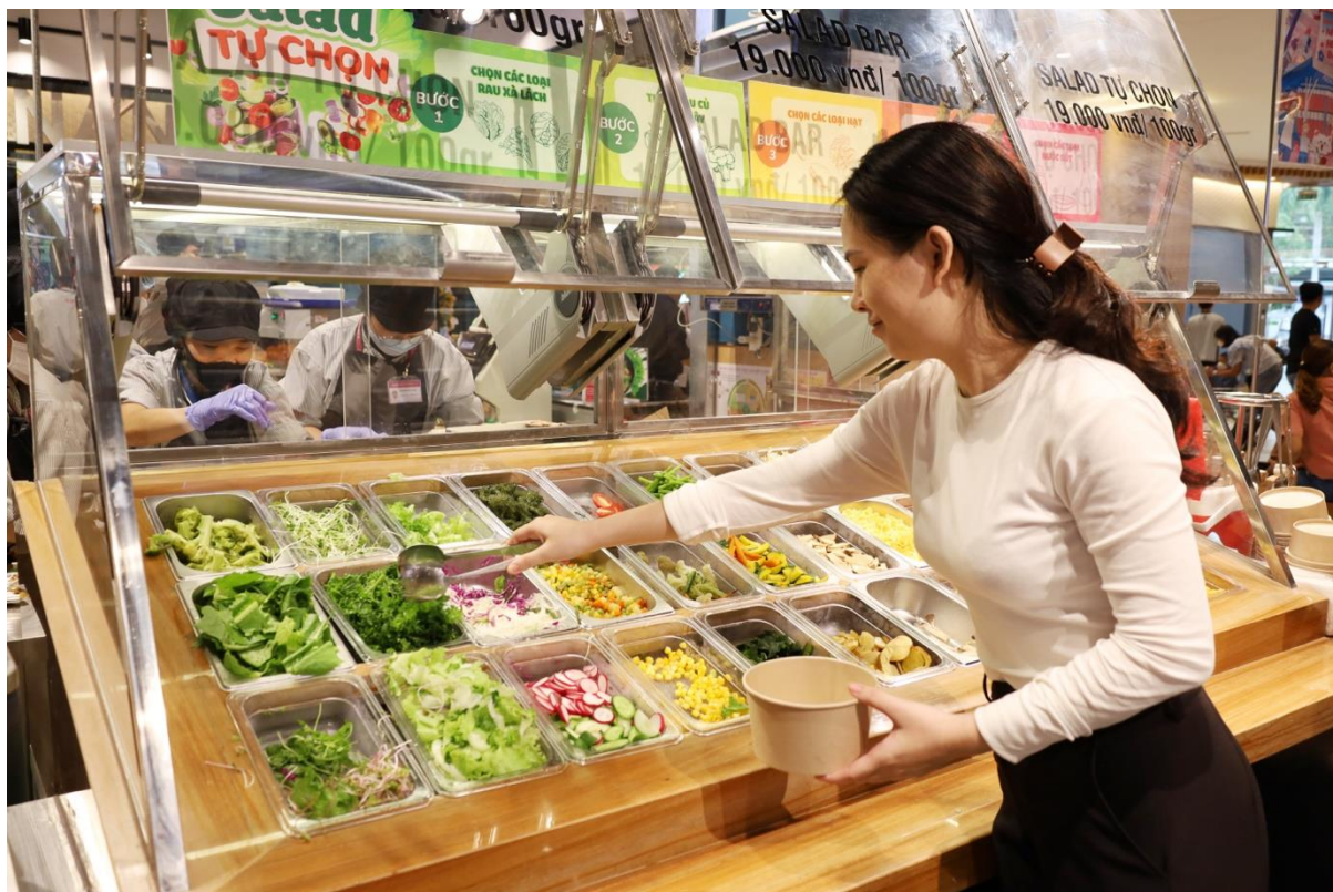
Salad bar at AEON Binh Duong New City Super Supermarket (SSM)