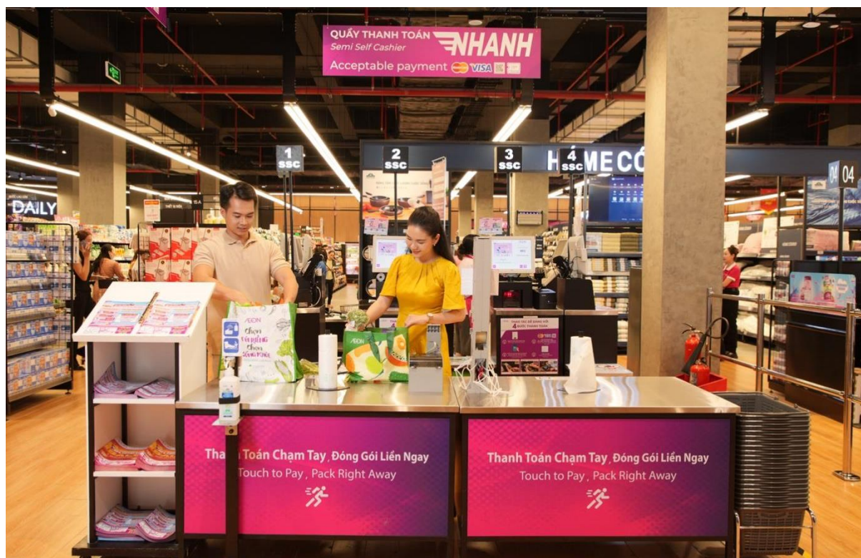
Self-semi cashier at AEON Supermarket Binh Duong New City

At AEON Binh Duong New City, following the digital transformation and the aim to bring convenience to customers, technology utilities are integrated such as smart lockers, automatic order picker, and self-semi cashier.