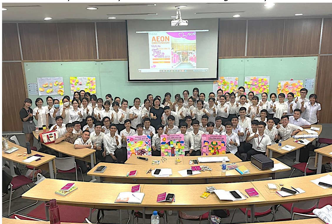
New employee training program of AEON Binh Duong New City to ensures customer service quality.