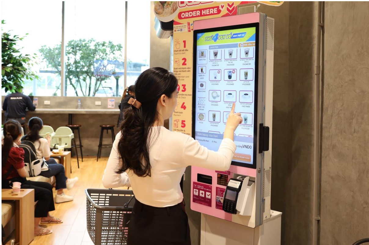
Customers experience the Automatic Order Picker at Super Supermarket (SSM) - AEON Binh Duong New City