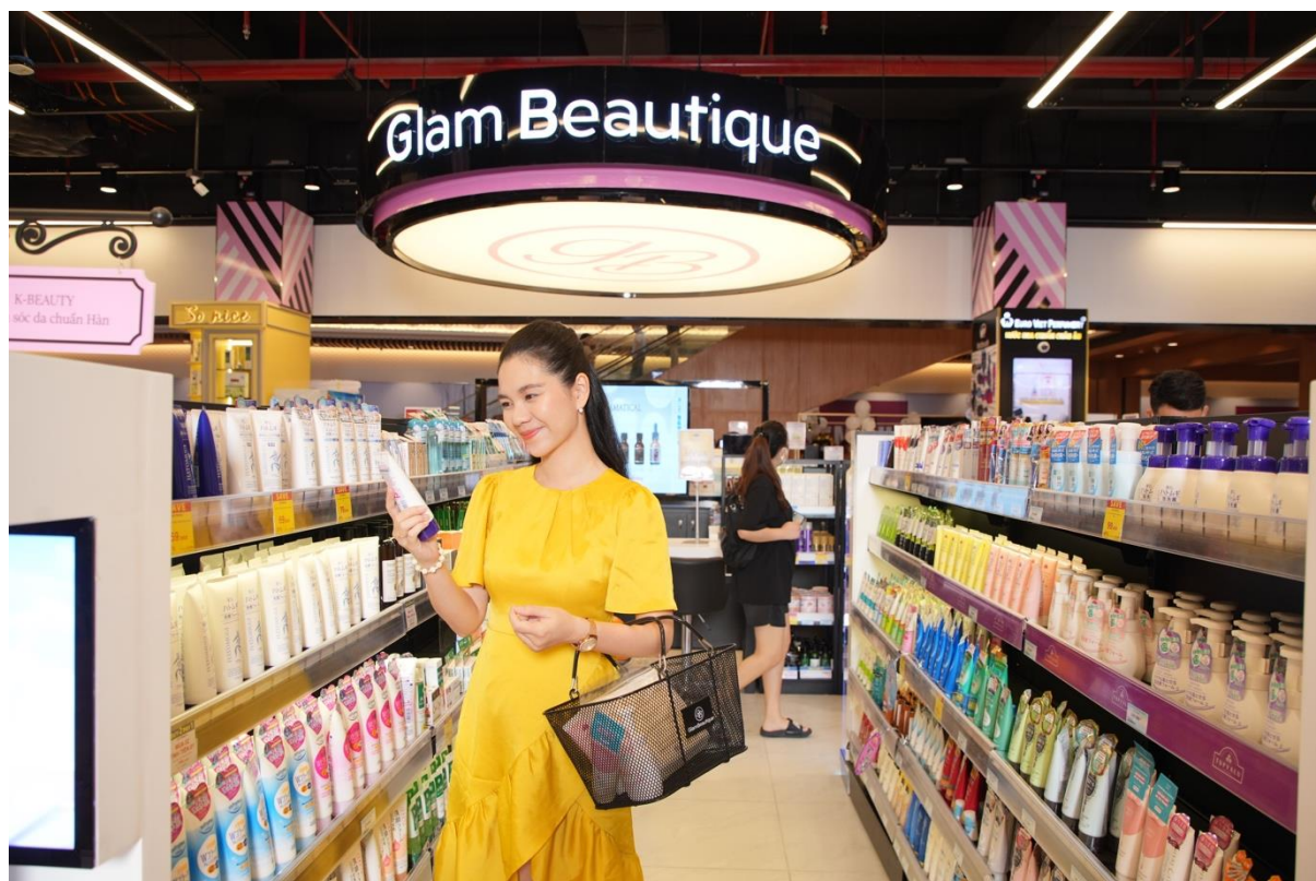
Glam Beautique - The specialty store of AEON Vietnam's chain of health and beauty stores - was also present at AEON Binh Duong New City