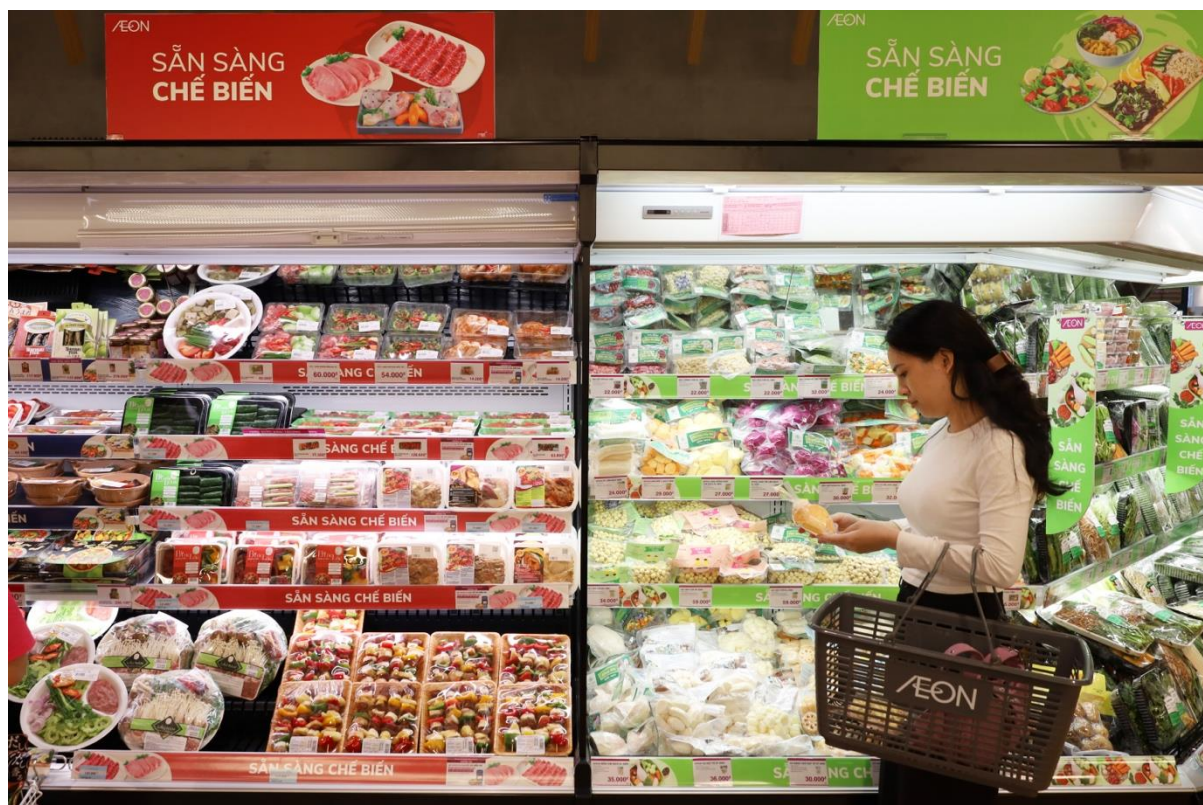
The "Ready-to-cook" pre-processed products at AEON Binh Duong New City Supermarket aim to bring convenience and comfort to customers.

Next is the Supermarket area - which satisfy a large number of local residents and young families shopping needs in the Binh Duong New City area. AEON Binh Duong New City Super supermarket brings high-quality and convenient products for daily life such as fresh ingredients and foods, organic products to meet the trend of healthy lifestyle. In addition, ready-to-eat and ready-to-cook products, frozen products, etc. Will be convenient to use, helping families save time.