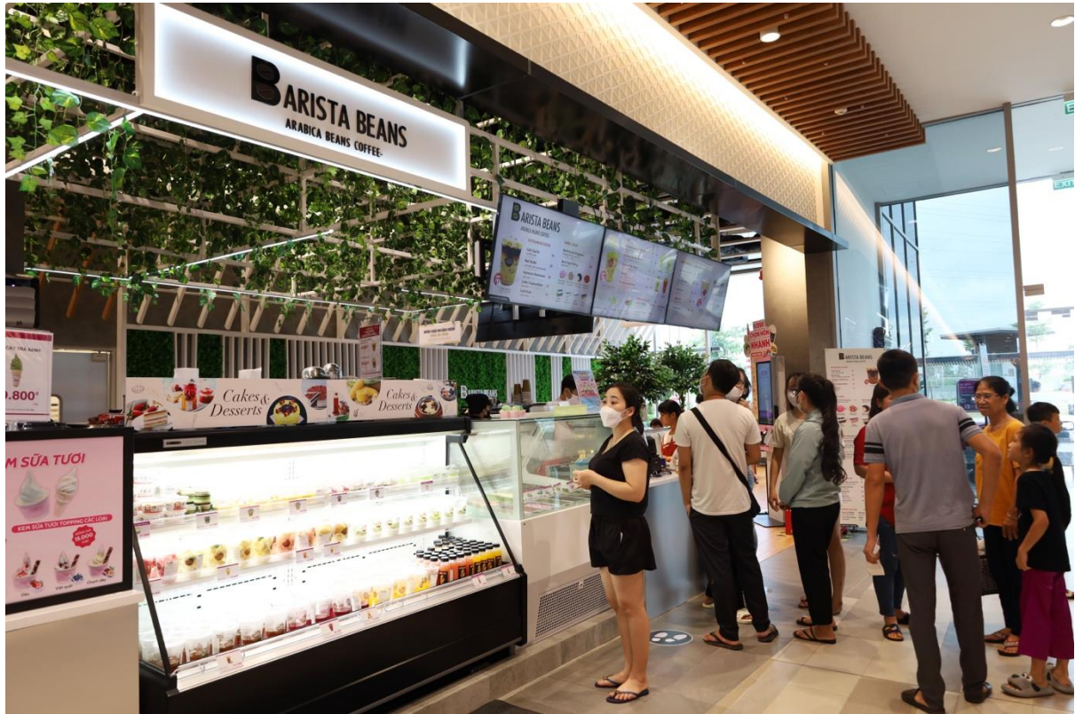
Barista Beans area at AEON Binh Duong New City specializes in serving delicious coffee and a variety of tea and cakes

Delica area, which has an area of more than 710m 2 with a capacity of 90 seats, is an ideal place for families, groups of friends to gather, enjoy cuisine from Japanese, Korean to Thai foods and salad bar, sushi bar, etc. The Barista Beans area specializes in serving delicious coffee and various tea and cakes, promising to meet the needs of all customers.