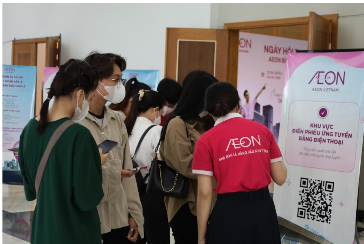
Recruitment Day of Super Supermarket (SSM) - AEON Binh Duong New City took place on May 13 and 20 in Binh Duong New City